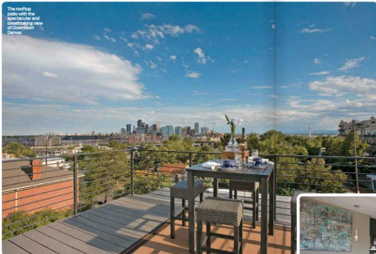
The rooftop patio with the spectacular and breathtaking view of Downtown Denver.

table is a functional unit which doubles up as a billiards table. The kitchen area is one large open unit with white shelves and drawers and brown wooden cupboards that serve as a beautiful contrast. Minimum yet effective lighting can be seen on the ceiling with small round natural lights.