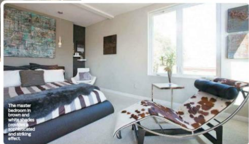
The master bedroom in brown and white shades provides a sophisticated and striking effect.