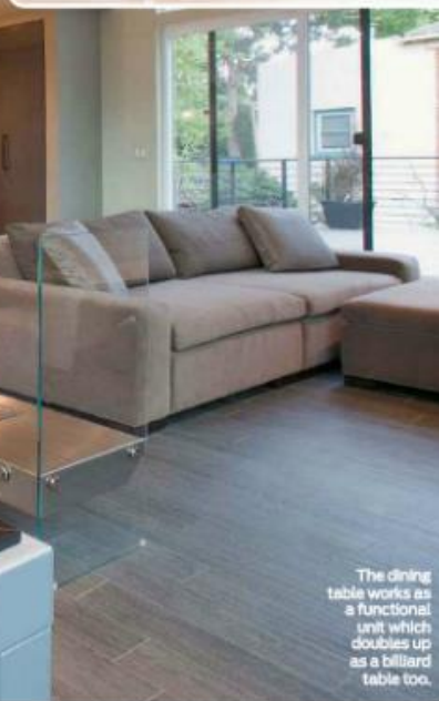
The dining table works as a functional unit which doubles up as a billiard table too.