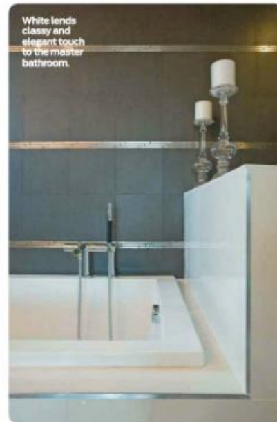
White lends classy and elegant touch to the master bathroom.