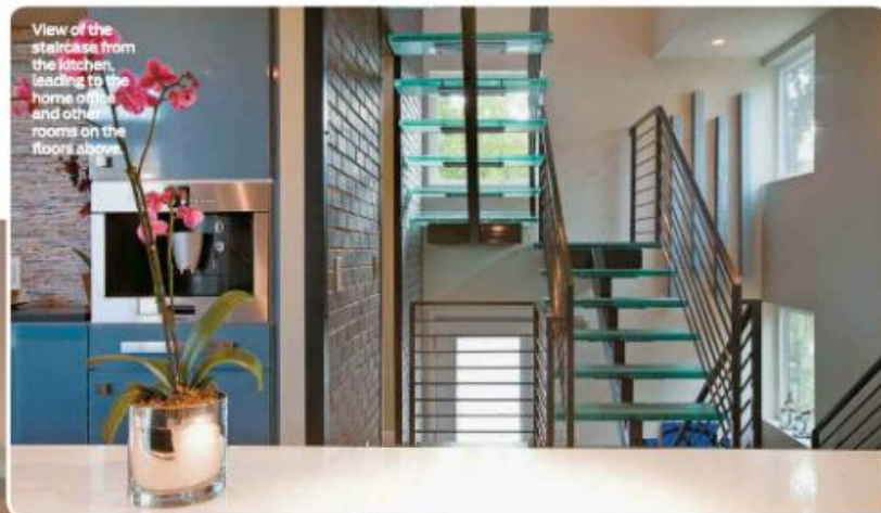
View of the staircase from the kitchen, leading to the home office and other rooms on the floors above.