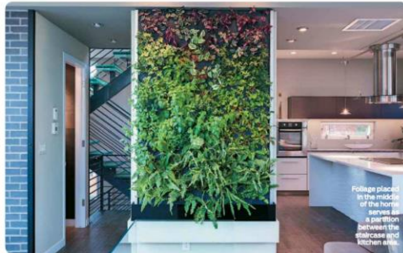
Foliage placed in the middle of the home serves as a partition between the staircase and kitchen area.

Green indoors can be seen with foliage placed in the middle of the house, near the staircase. This not only improves the quality of air indoors, but also adds a touch of freshness and beauty. Each room is a wide expanse of space, which is used very effectively. The dining