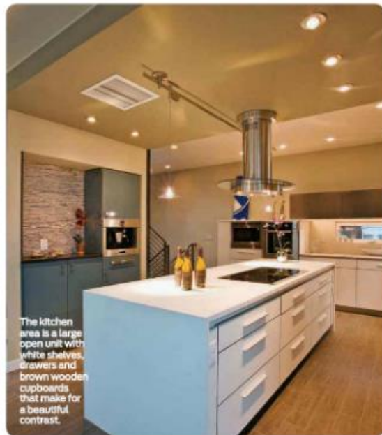
The kitchen area is a large open unit with white shelves, drawers and brown wooden cupboards that make for a beautiful contrast.

The two bedrooms in the house are designed using completely different concepts. One room has grey coloured walls that have a rustic feel. Contrasting upholstery in the room complements the décor. This area is dominated by brown shades, but a hint of blue and red gives life to the room. A large wall hanging is placed on one side of the room and can be seen in the master bedroom as well.